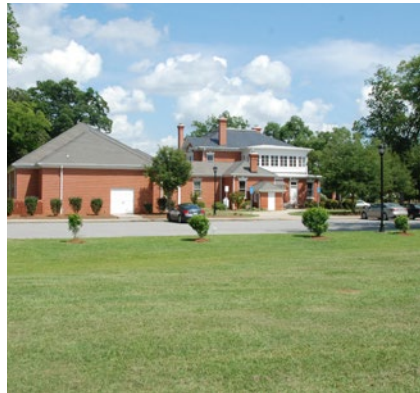
Lantana Lawn (Behind Building)