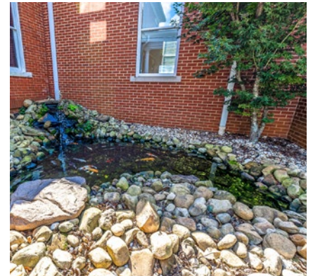
Koi Pond (Beside Rear Patio)