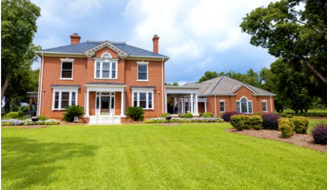
Rose Lawn (Front)