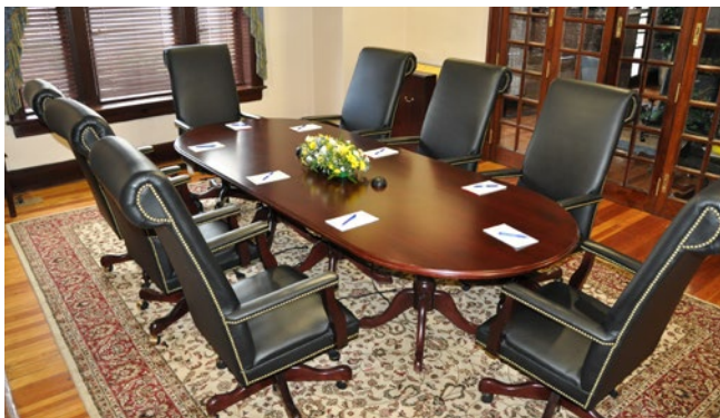
Camellia Executive Board Room