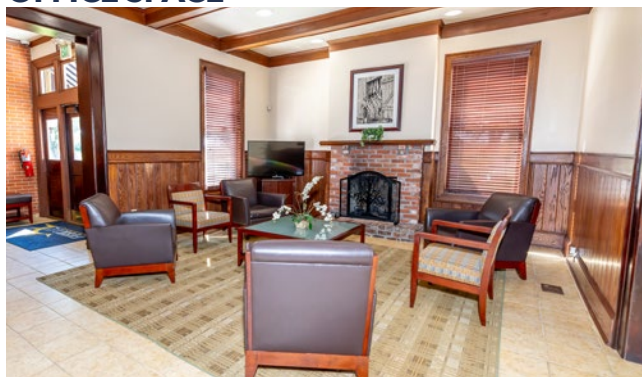
Persimmon Sitting Room