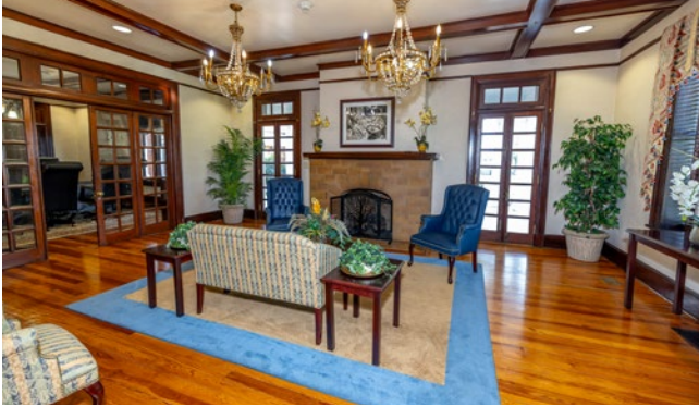
Peach Blossom Parlor