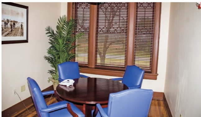
Blueberry Conference Room