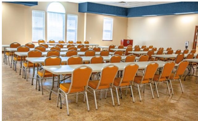
Paulownia Conference Room