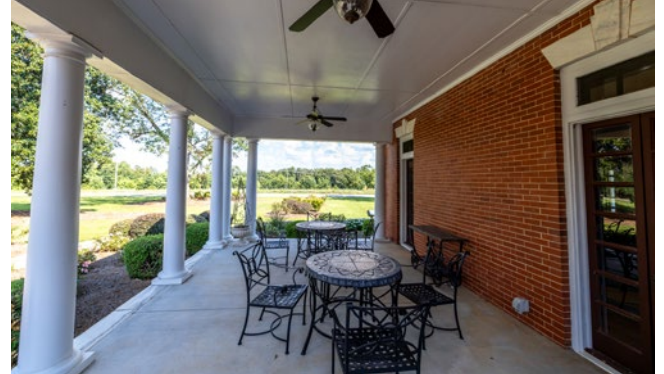
Magnolia Lawn (Patio, Koi Pond, Adjacent Lawn)