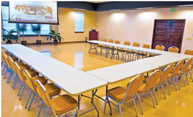
Paulownia Conference Room