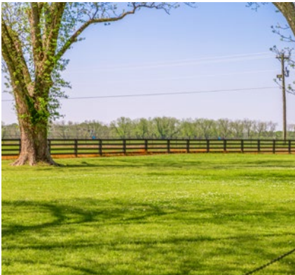
Pecan Lawn (Beside Building)