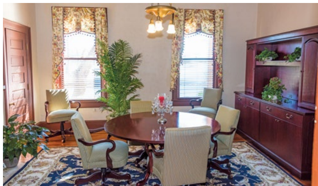
Crepe Myrtle Sitting Area