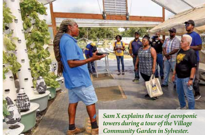
Sam X explains the use of aeroponic towers during a tour of the Village Community Garden in Sylvester.