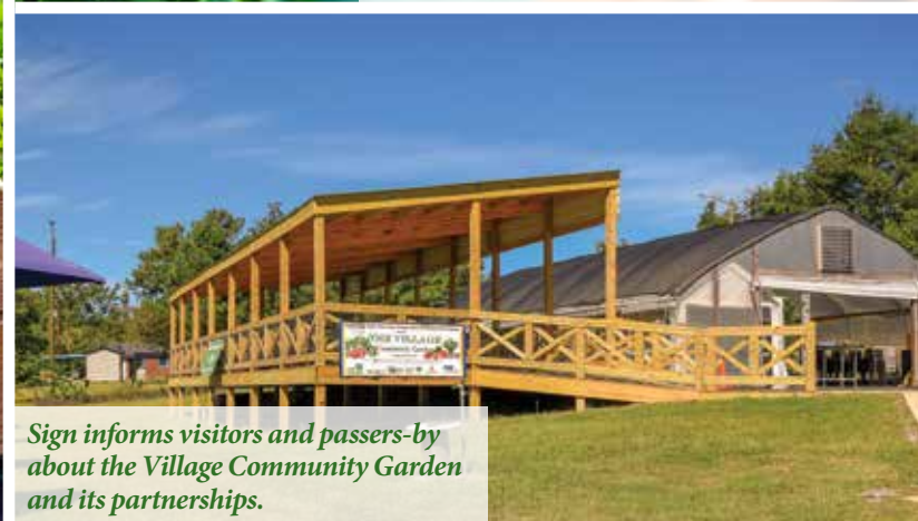
Sign informs visitors and passers-by about the Village Community Garden and its partnerships.

are,” she said. “I fell in love with the garden the first time I saw it. I told them whatever I can do for the garden, let me know,” she said.