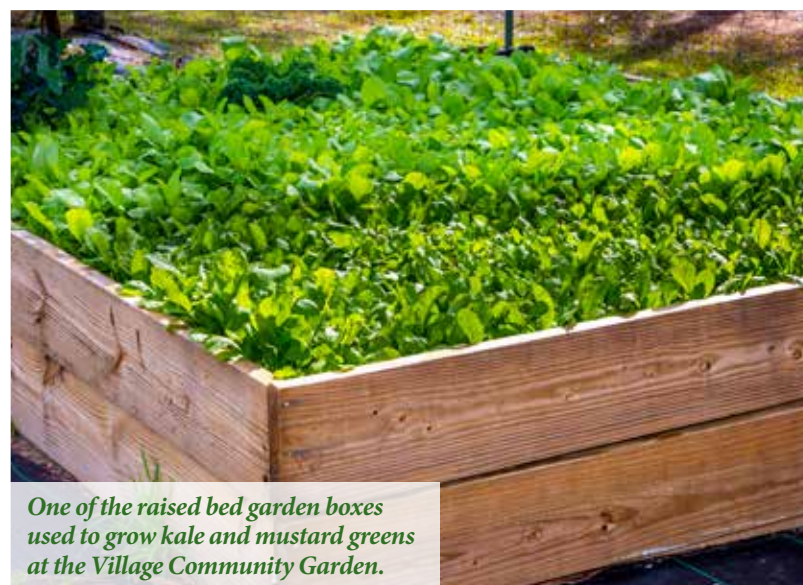
One of the raised bed garden boxes used to grow kale and mustard greens at the Village Community Garden.